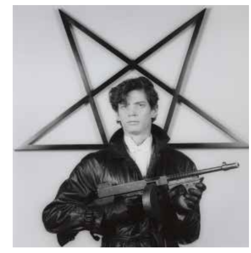
Robert Mapplethorpe Self Portrait 1983

In Self Portrait 1983 Mapplethorpe shows himself in battle dress (leather jacket), posing as a revolutionary figure, rifle in hand, in front of his sculpture Black Star 1983, which consists of a black-painted frame in the shape of a pentagram. This particular pentagram is inverted (one point facing down) and could therefore be interpreted as a symbol of the Devil. Mapplethorpe, brought up a devout Catholic, later liked